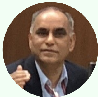
T.D. Dhariyal Former Commissioner of PwD, Delhi Govt