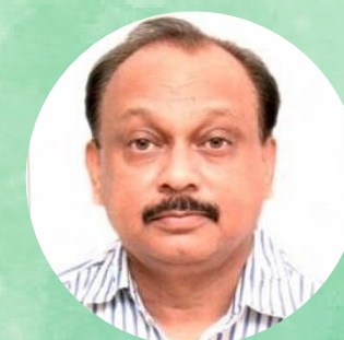
Mr. Sanjay Kant Deputy Chief Commissioner PwD, Govt of India