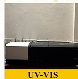
Instrumentation Facilities of School